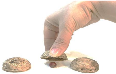
Figure. 1 Shell game

gestures. Now the operator asks the players to guess the shell under which the ball is hidden. Each player may choose the correct or wrong shell, depending on the degree of accuracy and intelligence. More points are awarded to the player that recognizes the correct shell.